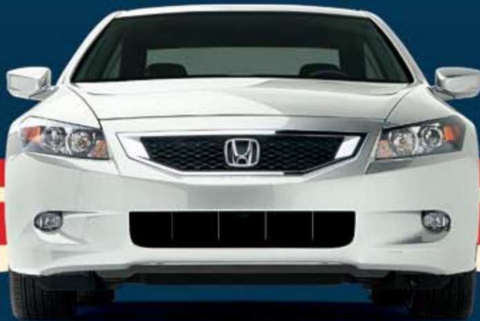
All-new 2010 Accord Crosstour 4WD EX-L